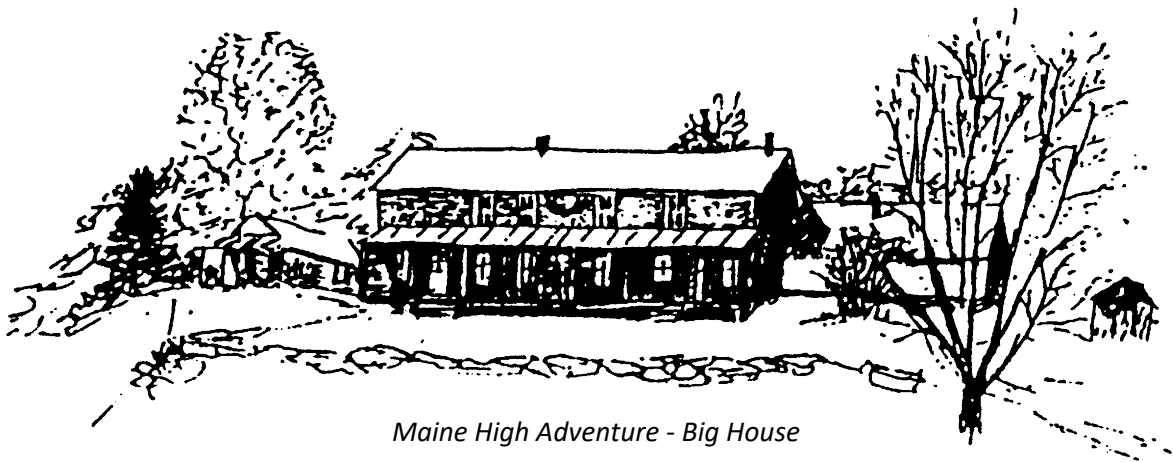
Maine High Adventure - Big House

The Maine High Adventure, BSA program is designed as a youth program that teaches and requires teamwork and communication and offers the opportunity to develop or enhance youth leadership and skills growth. The guides and other MHA staff strive to allow this process to occur. Once Day One, orientation day, is complete, the guide and advisors will step back into roles of support, and let the youth members of the crew, under the direction of the Crew Leader, develop their abilities to lead themselves and grow together as a team, and as individuals, and as backcountry travelers. It is hoped that the knowledge and confidence gained at MHA, by both the youth and adult crew members, will serve a conduit for taking the message of responsible backcountry use and resource conservation, to others in their units and communities across the country and world.